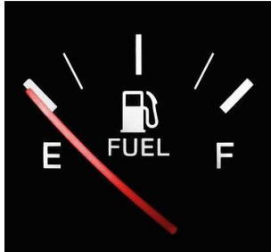
15%: $25/week = a half a tank of gas