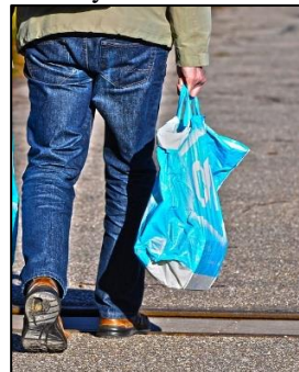
60%: $100/week = 1 week of groceries