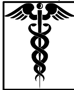
25%: $42/week = 1/3 a monthly health ins. bill