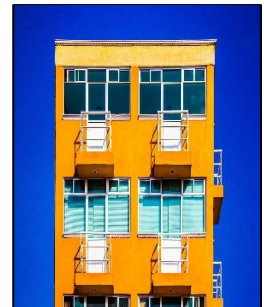
100%: $167/week = few days rent on Denver apt.