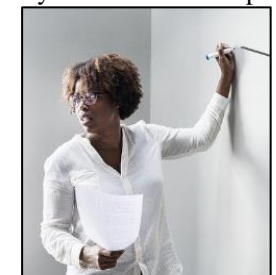
200%: $333/week = equity w/ FT colleagues