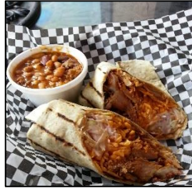
4%: $7/week = 1 deluxe burrito to go