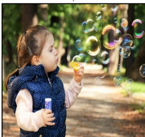
140%: $233/week = 4 days of daycare, one toddler