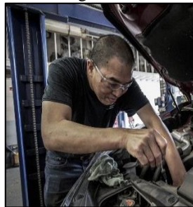
20%: $33/week = one oil change