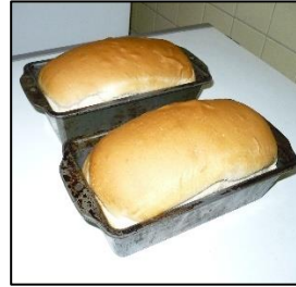
5%: $8/week = 2 loaves of bread, not fancy