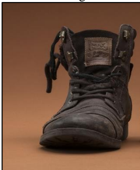
35%: $58/week = 1 leather shoe, on sale