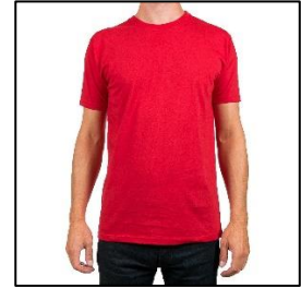
10%: $17/week = 1/2 a nice T-shirt, on sale