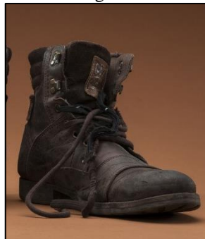
40%: $67/week = the other shoe + tax