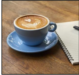
3%: $5/week = 1 latte

How does a percentage pay raise, phased in over five years, translate per course, per week, for CCCS adjunct faculty who teach 80% of all CCCS courses? CCCS average wage is $2,500 for teaching a college course. Their pay is so low they work other jobs, they receive no health-care benefits, and so the adjuncts struggle to live.