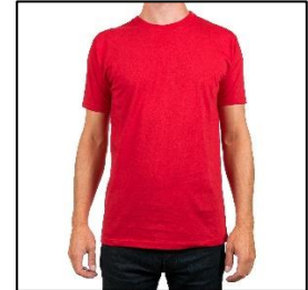
10%: $17/week = 1/2 a nice T-shirt, on sale