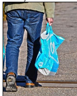
60%: $100/week = 1 week of groceries