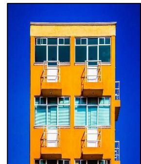
100%: $167/week = few days rent on Denver apt.