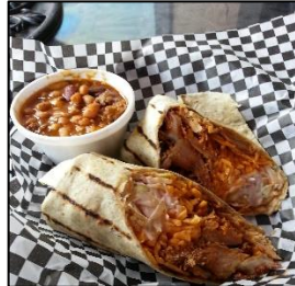
4%: $7/week = 1 deluxe burrito to go